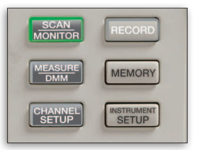
Scan, monitor, measure, and DMM function keys on the front panel.

Function keys are backlit so that you always know the mode of operation and recording status.